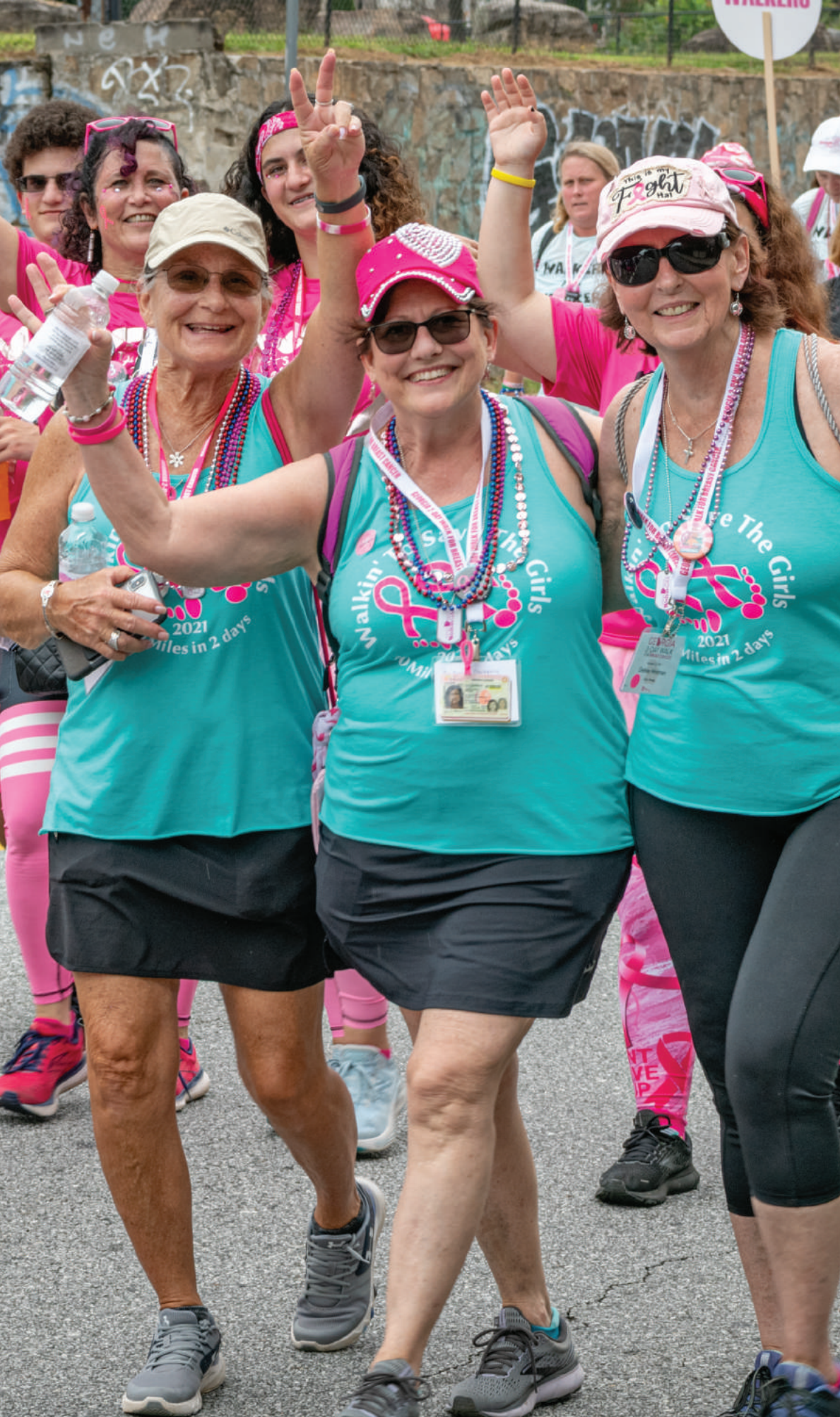
Georgia 2-Day Walk for Breast Cancer Sponsorship Opportunities